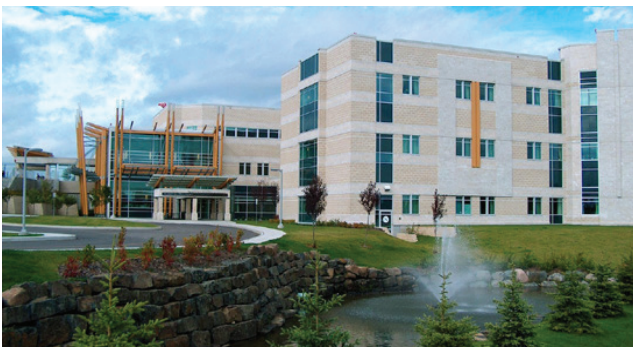
Thunder Bay Regional Health Sciences Center