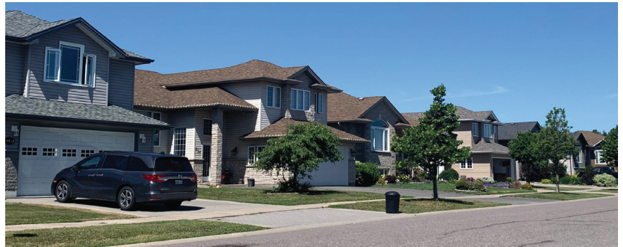
River Terrace Neighbourhood