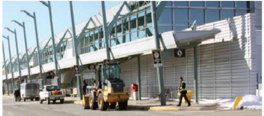
Thunder Bay Airport