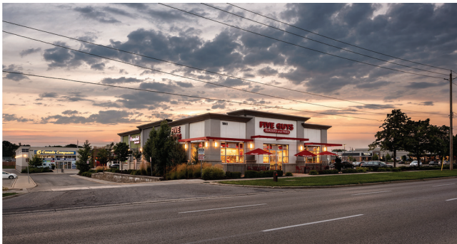
Five Guys Burgers and Fries