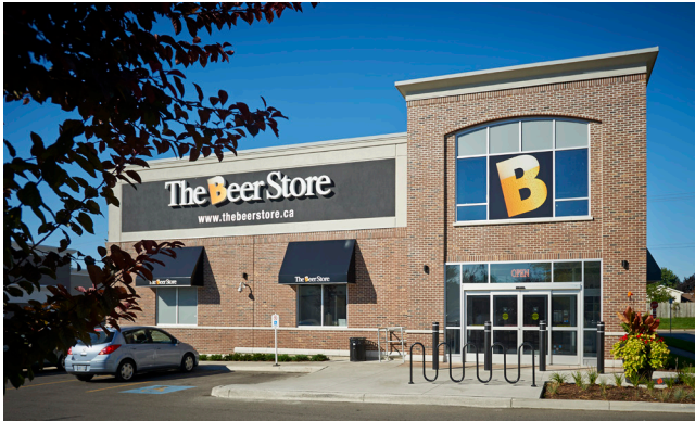
The Beer Store