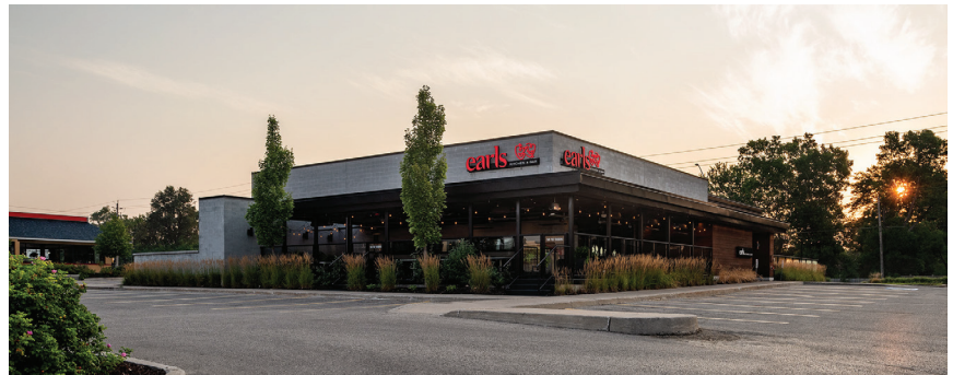
Earl's Kitchen & Bar